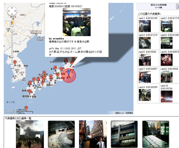
Figure 3: Geo-tweet photo clustering system. The geo-tweet photos in this figure are recorded at the day of the huge earthquake hit in Japan on March 11th, 2011.

To obtain tweets from Twitter, we can use two kinds of Twitter Web API, Twitter API and Twitter Streaming API. Since we can obtain tweets only for recent ten days at most via Twitter API, we are collecting geo-tweets via Twitter Streaming API. Through Twitter Streaming API, a huge amount of tweets are broadcasted continuously. In the system, the recording system selects only the tweets which have geotags and photo URLs from the tweet stream. We have been collecting geo-photo tweets continuously since February 2011. Currently, our geo-photo tweet database has more than 20 million geo-photo tweets. We collected 2.3 million geo-tweet photos a month last December, which is equivalent to one geo-tweet with a photo per second. The number of geo-tweet photos a month is increasing gradually.