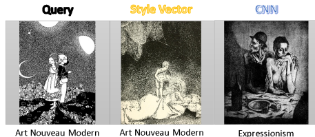
Figure 4: Similar images to a sample of “Art Nouveau Modern” by a style vector and a CNN feature.

Although the most effective style vector was S^{conv5.1} in