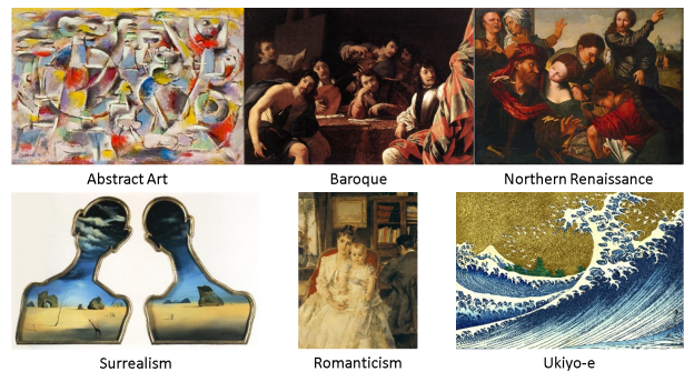
Figure 2: Images in “Style Dataset”.

For experiments, we prepared an artistic pictorial image dataset which contains metadata on image style and artists by gathering them from Wikiart.org, and classified them with style vectors extracted from five intermediate layers (conv1_1, conv2_1, conv3_1, conv4_1, and conv5_1) of