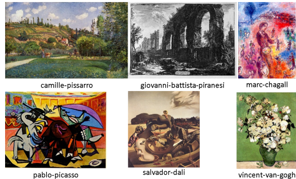
Figure 3: Images in “Artist Dataset”.

the VGG-16 network [9]. In addition, we also examined the combined style vectors of all the five layers as well. Finally, we compared performance with Karayev et al. [5] using the same dataset.