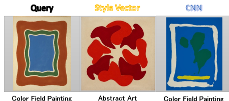
Figure 5: Similar images to a sample of “Color Field Painting” by a style vector and a CNN feature.