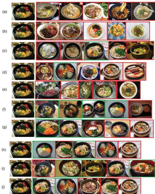
Figure 3. Image retrieval result examples. (a) PT. (b) SN-PT. (c) TN-PT. (d) FT. (e) SN-FT. (f) MT-SN-PT. (g) MT-SN-FT. (h) TN-FT. (i) MT-TN-PT. (j) MT-TN-FT.